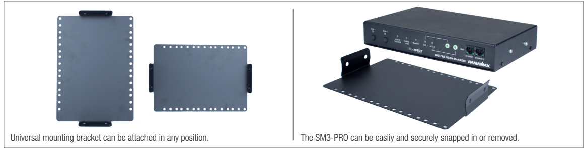
Universal mounting bracket can be attached in any position.