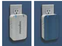
Front cover can easily be removed & painted to match any wall color.