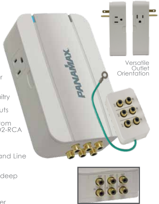
Versatile Outlet Orientation